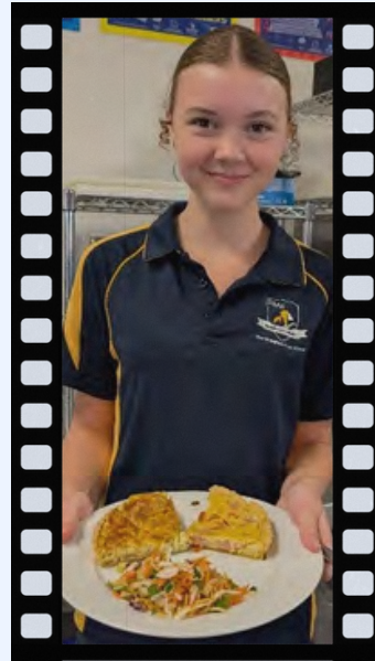
Jazz with bacon and cheese croquettes