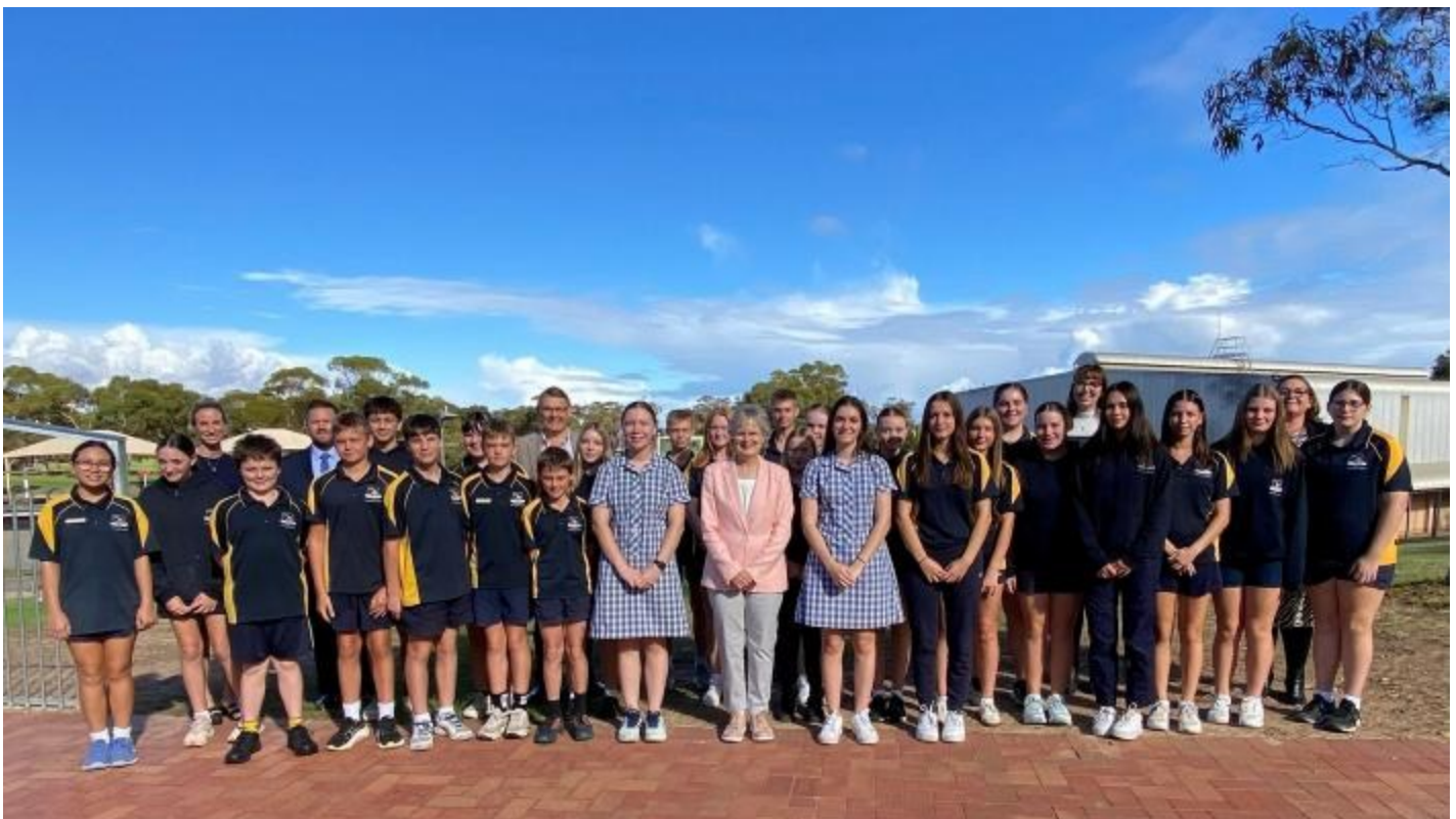
Students from Years 7 to 10 had the opportunity to meet with the South Australian Governor, Her Excellency the Honourable Frances Adamson AC. Her Excellency spoke about the importance of leadership, education and the many opportunities available to young people in South Australia. Students had the chance to ask questions relating to public life, contributing to their community and the nature of the role of Governor.