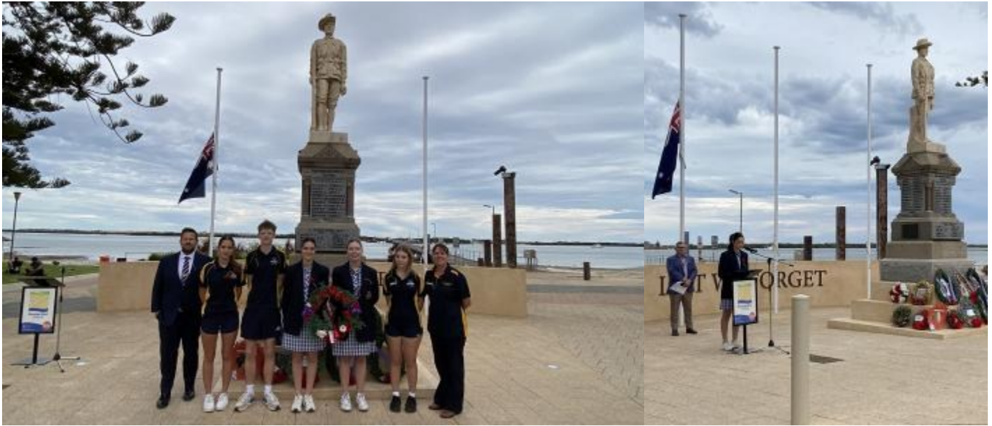
Some student leaders from Port Broughton Area School, took part in the local Anzac Day service at the Soldier Memorial on the foreshore. Reading 'In Flanders Fields' and laying a wreath for the school.