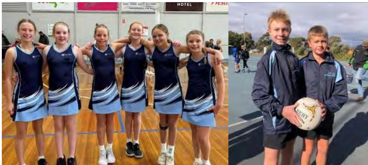
SAPSASA Netball Representatives

In week 9 we celebrated Wellbeing Week. It is a week to provide young people with the knowledge, skills and tools to manage their own mental health and wellbeing. Students had the opportunity to have some fun playing 'old-fashioned games'.