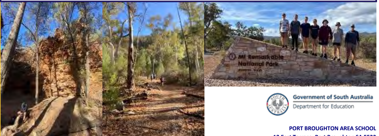
Outdoor Education Mambray Creek Bushwalk