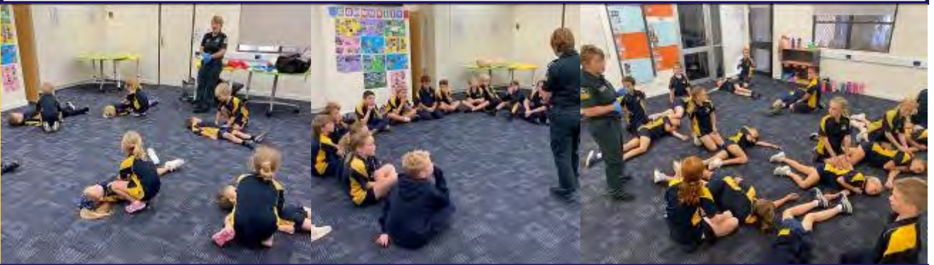
First Aid for Primary Class Students