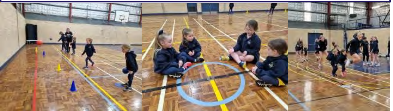
Reconciliation Week Activities - Now More Than Ever