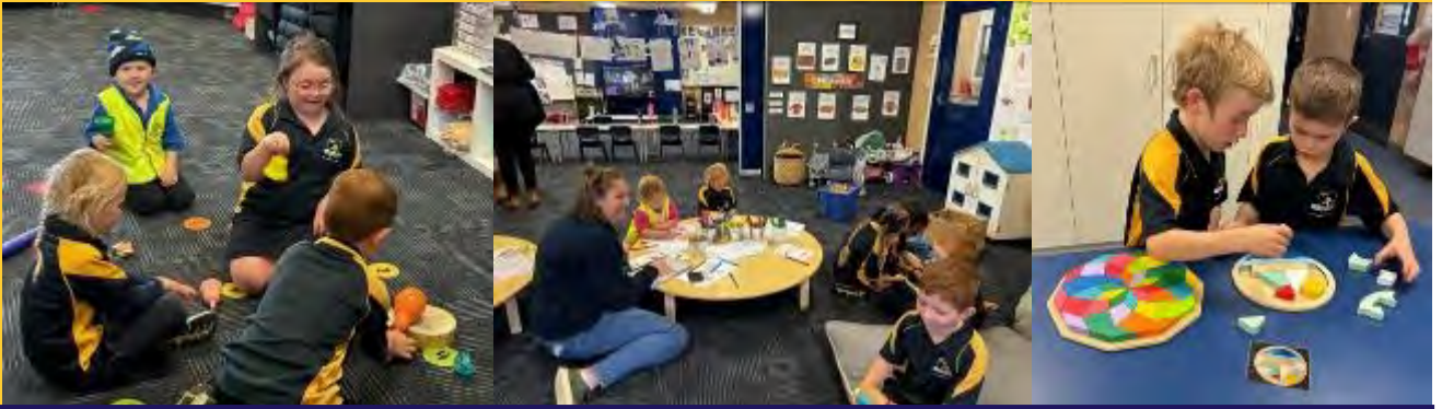
Strengthening Connections Between the School and Kindergarten

Abundant, ample, considerable, copious, countless, endless, immeasurable, jam-packed, lotsa, many, no end, plentiful, profuse, substantial, very many, things happening at PBAS.