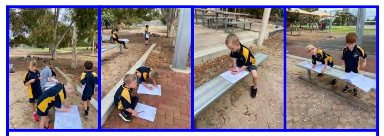
For Science the reception/year 1 students have learnt about the features of living things. Here they are observing and drawing birds in our school.