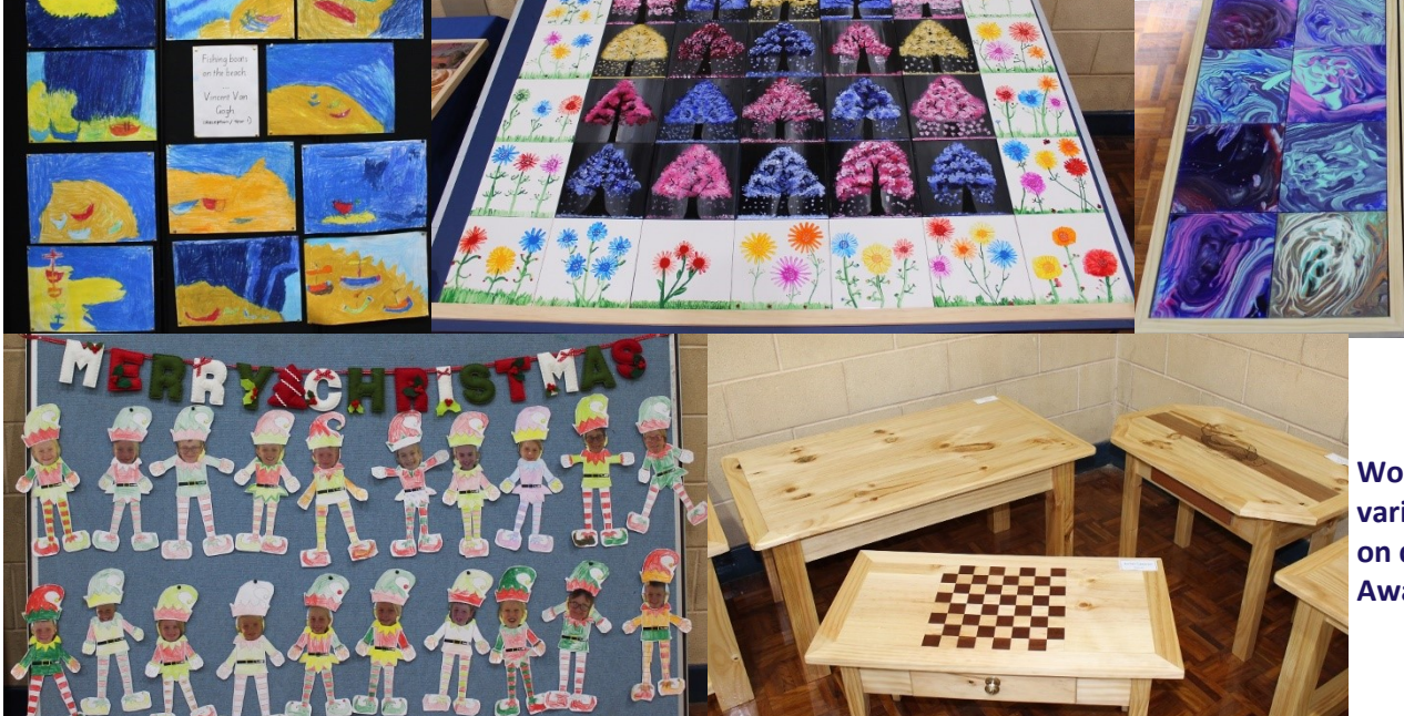
Work from various classes on display at the Awards Day