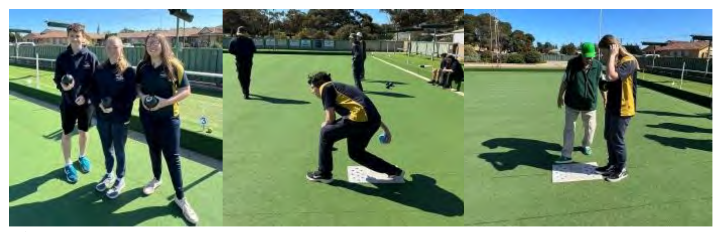
9/10 HPE students are engaging with the local lawn bowls club to learn the tricks of the trade. Students are highly enjoying this new experience and it is even sparking an interest in some students to join the club and participate outside of school.