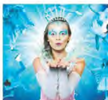
FAIRYTALES ON ICE Fri 14 Oct at 6:30pm

HOME Tues 6 Sept at 10am & 1pm School Show