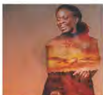
THE DEEP NORTH Tues 25 Oct at 11am - SCHOOL SHOW Tues 25 Oct at 7pm