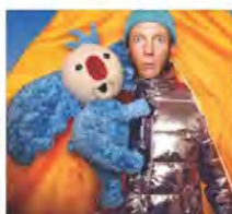
HICCUP! Windmill Theatre Co Tues 15 Nov at 10am & 12pm SCHOOL SHOWS