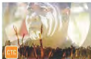
THE LAKE OF SCARS Fri 8 Jul at 7pm

*TRANSACTION FEES APPLY TO ALL LIVE SHOW*