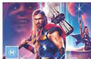
THOR: LOVE AND THUNDER Thurs 4 Aug at 7pm Fri 5 Aug at 8pm Sat 6 Aug at 8pm

Thor is on a journey unlike anything he's ever faced -- a quest for inner peace. But his retirement is interrupted by a galactic killer known as Gorr the God Butcher, who seeks the extinction of the gods.