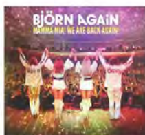
BJORN AGAIN - MAMMA MIA! WE ARE BACK AGAIN! Sun 20 Nov at 7pm