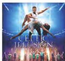
CELTIC ILLUSION REIMAGINE Wed 6 Jul at 7:30pm