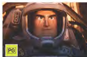
LIGHTYEAR Sat 9 Jul at 2pm Sun 10 Jul at 2pm Mon 11 Jul at 10am & 2pm Tues 12 Jul at 10am - Sensory Tues 12 Jul at 2pm Wed 13 Jul at 10am, 2pm & 6pm

The sci-fi action-adventure presents the definitive origin story of Buzz Lightyear, the hero who inspired the toy! Introducing the legendary Space Ranger who would win generations of fans.