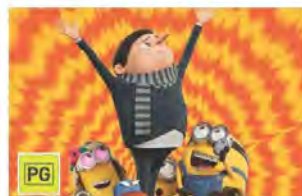
MINIONS: THE RISE OF GRU Thurs 14 Jul at 11am & 2pm Fri 15 Jul at 2pm Sat 16 Jul at 2pm Tues 19 Jul at 11am (Sensory) & 6pm Wed 20 Jul at 2pm Thurs 21 Jul at 2pm Fri 22 Jul at 2pm

In the 1970s, young Gru tries to join a group of supervillains called the Vicious 6 after they oust their leader -- the legendary fighter Wild Krush. When the interview turns disastrous, Gru and his Minions go on the run with the Vicious 6 hot on their tails.