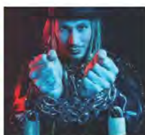
COSENTINO - DECEPTION Tues 18 Oct at 7:30pm