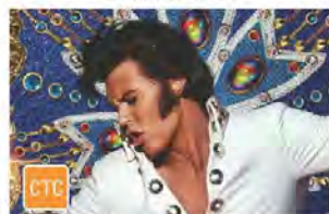
ELVIS Fri 15 Jul at 10am - Coffee Flix Fri 15 Jul at 7pm Sat 16 Jul at 7pm

Elvis Presley rises to fame in the 1950s while maintaining a complex relationship with his manager, Colonel Tom Parker.