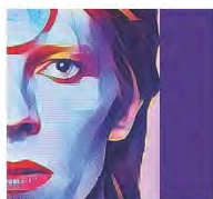
ASHES TO ASHES: THE DAVID BOWIE EXPERIENCE Sat 23 Apr at 7:30pm