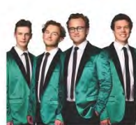
THE 60 FOUR: IN CONCERT Sat 9 Apr at 7:30pm