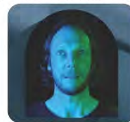
CATHEDRAL BY CALEB LEWIS Fri 10 Jun at 12:30pm