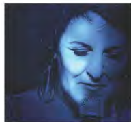
BLUE: THE SONGS OF JONI MITCHELL Wed 4 May at 7:30pm