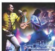
QUEEN FOREVER: BREAK FREE TOUR Sat 11 Jun at 8pm