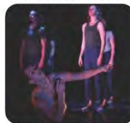
OUTSIDE WITHIN Australian Dance Theatre Mon 16 May at 7:30pm

**MASKS MUST BE WORN AT ALL TIMES IN THE VENUE**