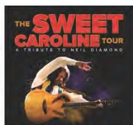
THE SWEET CAROLINE TOUR: A TRIBUTE TO NEIL DIAMOND Mon 11 Apr at 8pm